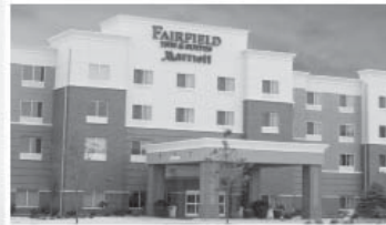
Fairfield Inn & Suites 308-236-4200