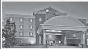
Holiday Inn Express 308-234-8100