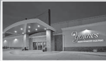
Younes Conference Center 308-234-2212