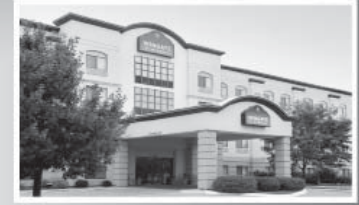
Wingate Inn 308-237-4400